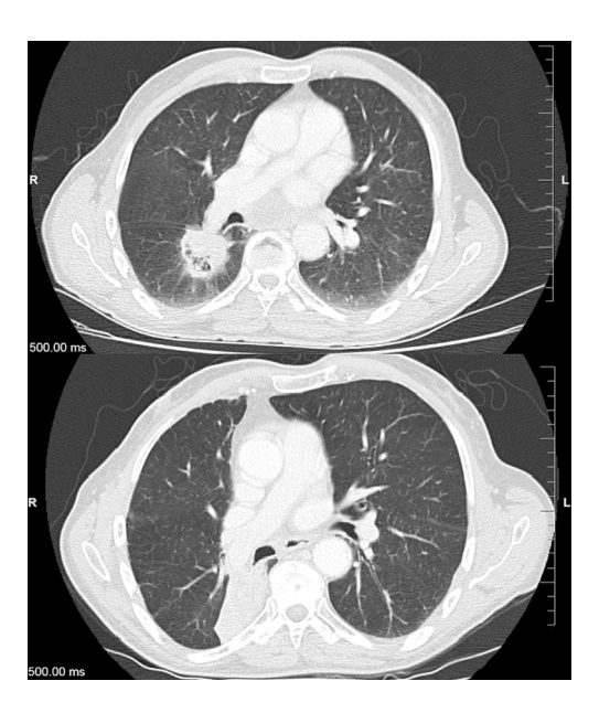
Figure 1 Ultracentral tumor before and after stereotactic body radiotherapy. Treatment of an ultracentral tumor which was abutting the right proximal bronchus. Stereotactic body radiotherapy was delivered to the tumor with a dose of 60 Gy in 8 fractions. The inferior image was taken two years following SBRT, demonstrating post radiation fibrosis/atelectasis.

toxicity profiles between peripheral, central or ultracentral tumors (27). Put together, there does not appear to be a difference in survival or control rates with ultracentral tumors with SBRT, but greater concerns remain regarding the toxicity profile. Figure 2 demonstrates a treatment plan of an ultracentral tumor, using a definition of PTV overlap with the proximal bronchi.