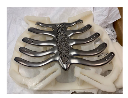
Figure 3 Custom prosthesis designed by 4Web.