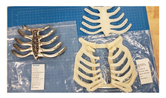
Figure 4 Titanium prosthesis (left), plastic reconstructions for preoperative planning (right).

bypass graft (CABG) surgery. In 2015 she underwent triple vessel CABGs, re-presenting two weeks later with sternal wound dehiscence and deep wound infection necessitating repair with sternectomy ( Figure 1 ). Debridement resulted in the removal of most of her sternum, requiring reconstruction using a right rectus abdominis muscle flap.