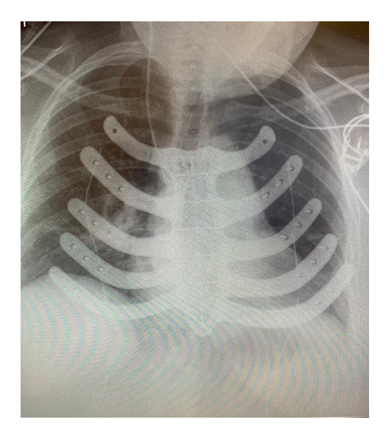
Figure 5 Post-operative chest X-ray.

The implant combines the reconstruction concepts described above, utilising bone marrow from the femur to promote osteogenesis, whilst providing anterior chest wall stability; particularly in patients with little sternal tissue remaining.