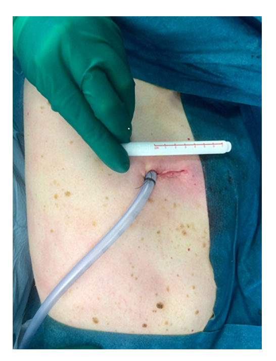
Figure 1 Uniportal approach with 4 cm incision and 24 French chest tube.

a less invasive approach that allows even major thoracic operations to be performed through a single small incision of some centimeters. Consistent reports confirmed different advantages of uniportal VATS, e.g., reduced surgical trauma, decreased postoperative pain, faster rehabilitation, and improved patient satisfaction with a less invasive approach than conventional VATS, but also with no significant differences in safety at the same time (23-25).