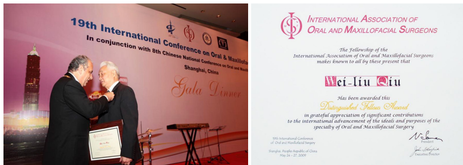
Figure 8 Award and certificate granted by the International Association of Oral and Maxillofacial Surgeons (IAOMS).

establishing the human tongue carcinoma cell line.