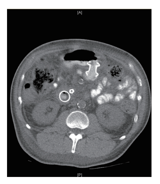
Figure 2 CT abdomen after EUS-GJ showing the LAMS. EUS-GJ, endoscopic ultrasound guided gastrojejunostomy; LAMS, lumen apposing metal stent.

Translational Gastroenterology and Hepatology, 2018