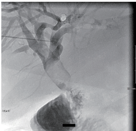
Figure 2 Percutaneous cholangiogram showed filling defect within the common hepatic duct proximal to the hepaticojejunostomy anastomosis.

malignancy. EHL was performed for stone fragmentations. Follow up cholangiogram demonstrated contrast freely draining from biliary system into small bowel; thus, the biliary drainage catheter was removed. Patient responded well at twelve months follow-up post-PTCS with SDVS.