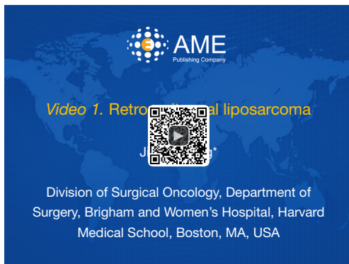
Figure 2 Retroperitoneal liposarcoma (1).

Available online: http://aos.amegroups.com/post/view/2017121102