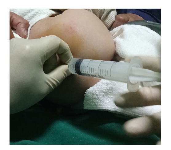
Figure 2 Caudal block technique.