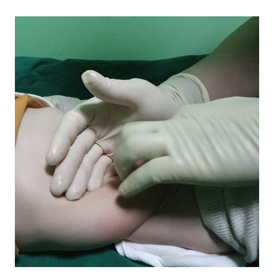
Figure 3 Manual reduction technique to intestine intussusception.

needle was inserted at a 60–90° to skin surface and advanced until a 'pop' (piercing the sacrococcygeal ligament) was felt, then lowered to a 20–30° angle to the skin and advanced an additional 2–3 mm into the sacral canal. After confirming that cerebrospinal fluid or blood could not be aspirated or free flowing from the needle, a test dose of 0.8–1 mL·kg<sup>-1</sup> of local anesthetic (1% lidocaine) was injected under hemodynamic and ECG monitoring. Following a negative test result, the rest LA was injected slowly over 1 min with little resistance. If the needle tip touched bone, or if there was a bloody puncture or subcutaneous bulging occurred, the needle was reinserted at an angle slightly different to the original angle. Following this, patients were turned into