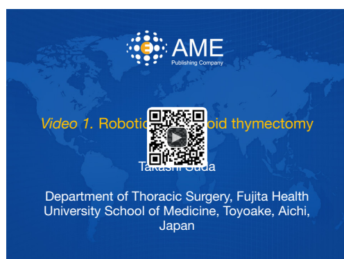
Figure 2 Robotic subxiphoid thymectomy (4). Because the tumor was in contact with the innominate vein in this case, tape was applied to the central side of the tumor and the peripheral side of the innominate vein.

Available online: http://www.asvide.com/article/view/32332