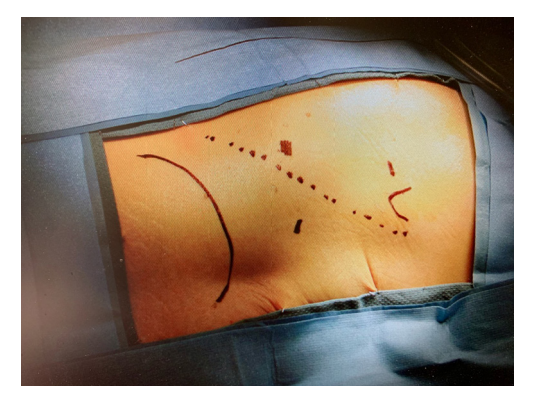
Figure 2 Preoperative marking of thoracic port placement during semi-prone position with anatomic markers.