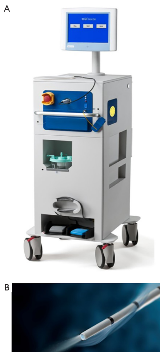
Figure 3 Overview of truFreeze ® (CSA medical, Lexington, Massachusetts) cryospray equipment. (A) truFreeze cryospray system and (B) catheter.

Endoscopic eradication therapy can be performed using