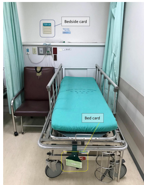
Figure 1 Traditional bedside card (blue dot) and bed card (yellow dot) in the emergency department.

The workload of the emergency staff is very heavy, and the patients' locations change frequently. After ER physicians visit the patients, some must remain in bed, awaiting laboratory results and anticipating treatments. After the ER physicians' re-evaluation, some patients are discharged with medicine, while others are admitted to the hospital or transferred to other hospitals. Therefore, the information on bedside card must change frequently to correctly reflect the patients' information and status. If the actual information on the bedside card is not updated quickly with the change of each patient, the medical staff may provide the incorrect treatment to the incorrect patient, thereby increasing the risk of medical litigation. Furthermore, the beds in the ER are limited and need to be fully utilized. Therefore, a real-time bedside card recording