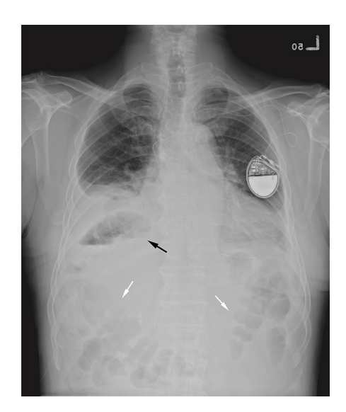
Figure 1 Plain radiograph of the chest in upright position demonstrated a multilobulated gas of the gas-forming liver abscess (black arrow) presenting between colon gas (white arrows) and right basal lung.

Gas-forming pyogenic liver abscess (GFPLA) is uncommon and has an annual incidence rate of 7–24 % of all pyogenic liver abscesses. It is associated with a higher mortality rate compared to non-GFPLA. K. pneumoniae is the most commonly associated bacterium with pyogenic liver abscess