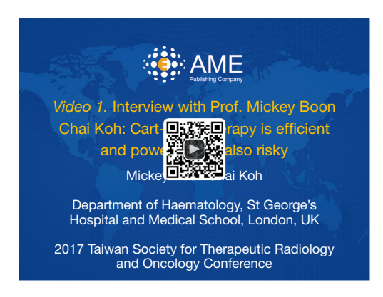
Figure 3 Interview with Prof. Mickey Boon Chai Koh: Cart-T cell therapy is efficient and powerful, but also risky (1). Available online: http://www.asvide.com/article/view/23426