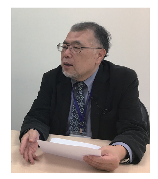
Figure 1 Photo of Prof. Mitsunori Kirihata.

BNCT is a non-invasive therapeutic modality using the non-radioactive isotope boron-10 (<sup>10</sup>B) for treating locally invasive malignant tumors, for instance, primary brain tumors and recurrent head and neck cancer. BNCT can be mainly divided into two parts. Firstly, the patient is injected with a tumor-localizing drug containing the non-radioactive <sup>10</sup>B having a high propensity or cross section ( \sigma ) to capture slow neutrons. The cross