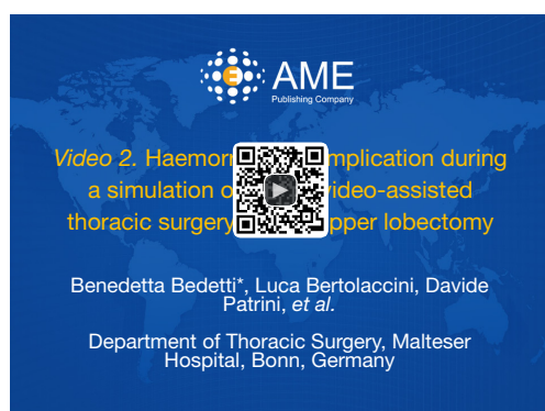
Figure 2 Haemorrhagic complication during a simulation of a right video-assisted thoracic surgery (VATS) upper lobectomy (12). Available online: http://www.asvide.com/article/view/26670

The traditional training model of modern thoracic surgical education is evolving in relation to patient safety, increasing the difficulty and heterogeneity of the surgical procedures. Recent analyses state that, by complex VATS procedures, 90 to 100 cases may be required to achieve an optimal technical level (shorter operative time and lower conversion rate (13,14). To adapt to these factors, a development of the actual teaching programs is taking place to advance cognitive and procedural abilities prior to performing in the operation theater. VR training programs are not designed as an alternative to the practice in operating theatres, but it should support a portion of the learning curve. The best approach for VR training and assessment is still debated and investigated. VR simulators have many advantages over animal models or over the traditional box trainer, including a shorter preparation time or more realistic features of the simulated VATS procedures. A VR simulator can, in fact, realistically simulate complications like bleedings or anatomical variations, which are very useful tools to speed up the learning curve for VATS procedures. Furthermore, VR simulators intended to stimulate both cognitive and psychomotor resources offer a fundamental support for practical training and evaluation. The interaction of the cognitive and psychomotor layers in simulations has been demonstrated to enhance the learning process (15). The