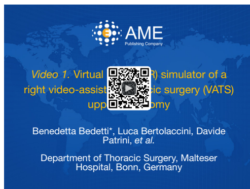
Figure 1 Virtual reality (VR) simulator of a right video-assisted thoracic surgery (VATS) upper lobectomy (11).

Available online: http://www.asvide.com/article/view/26669