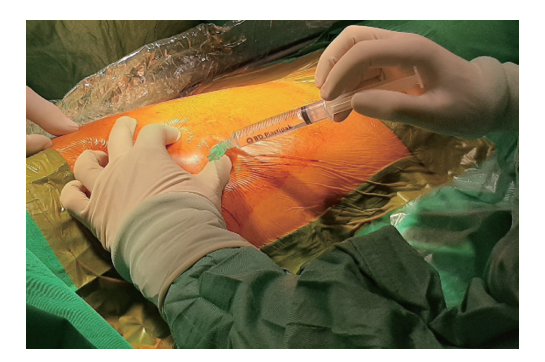
Figure 1 Skin infiltration of local anesthesia in non-intubated patient.