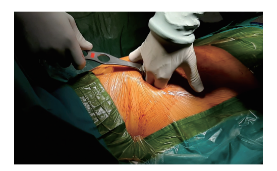
Figure 3 Intercostal space enlarged with 2–3 fingers insertion.