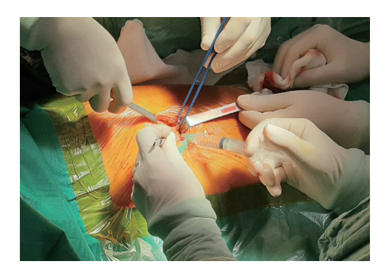
Figure 2 Under vision intercostal blockade after serratus retraction.