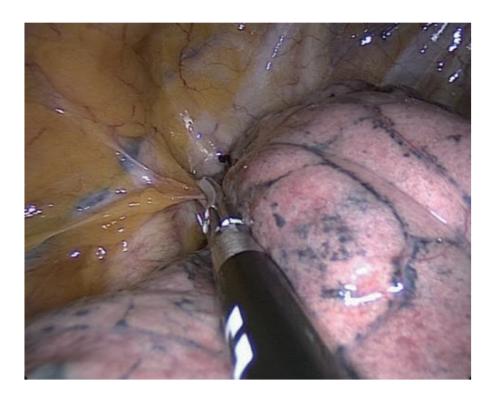
Figure 4 Pleuro-pulmonary adhesions division by energy device.

Figure 3 Intercostal space enlarged with 2–3 fingers insertion.