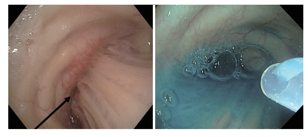
Figure 2 Administration of Duraseal® via guide sheath catheter at the site of the air leak. Note: Illustration is not of the case described, but of another patient.

synthetic, absorbable polyethylene glycol (PEG) hydrogel, historically used for the purpose of being a sealant and preventing cerebrospinal fluid leakage in cranial and spinal dural repair. Its inherent hydrophilic properties allow for the glue to swell after applied to the directed area. These properties permit the glue to provide a watertight seal, allowing more time (4–6 weeks) for healing. Neurosurgical studies have shown a high rate of successful intraoperative watertight seals with low rates of adverse effects in patients requiring dural closures (9,10).