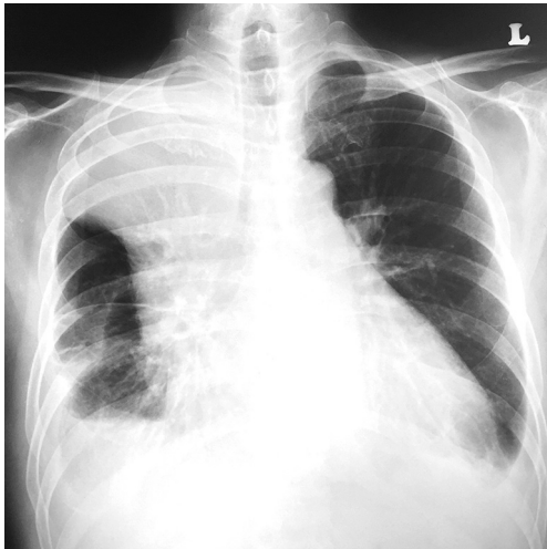
Figure 1 Right upper lobe homogeneous opacity suggestive of consolidation.

led to multiple attempts of therapeutic thoracocentesis. Haemodialysis was eventually started five months prior to current presentation but was inadequate due to poorly developed arterio-venous fistula. Dry weight was not achieved and patient remained in overloaded state most of the time. He was subsequently referred to respiratory team for opinion of bilateral pleural effusion, which was more on the right with pleural fluid analysis showing protein-discordant exudates. Medical thoracoscope subsequently revealed mildly inflamed and thickened parietal pleural. Right middle lobe was adhered to the chest wall and access to apical region was thus restricted. Parietal pleural biopsy yielded chronic inflammation. Workup for tuberculosis was negative. Patient was treated with two months of oral antimicrobial with the impression of secondarily infected pleural cavity from repeated thoracocentesis.