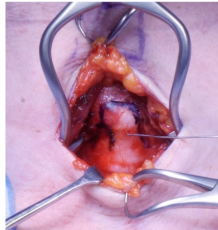
Figure 3 Dissection onto cricotracheal cartilage.