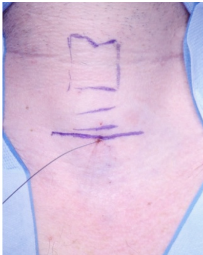
Figure 2 Surface marking of larynx with location needle in situ and skin incision marked.