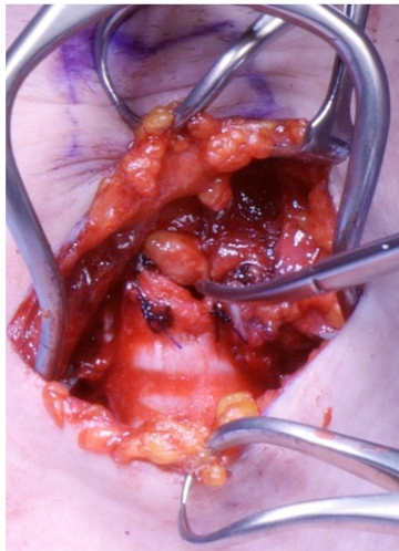
Figure 5 Primary anastomosis of cricotracheal defect.

Histopathological analysis revealed a well circumscribed spindle cell tumour in the mucosa with characteristic features of schwannoma. There was no atypia or invasion. All margins were reported clear on final histopathology. Clear margins had been achieved.