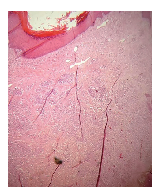
Figure 1 Tufted angioma: numerous lobules in the dermis (H&E 4x).