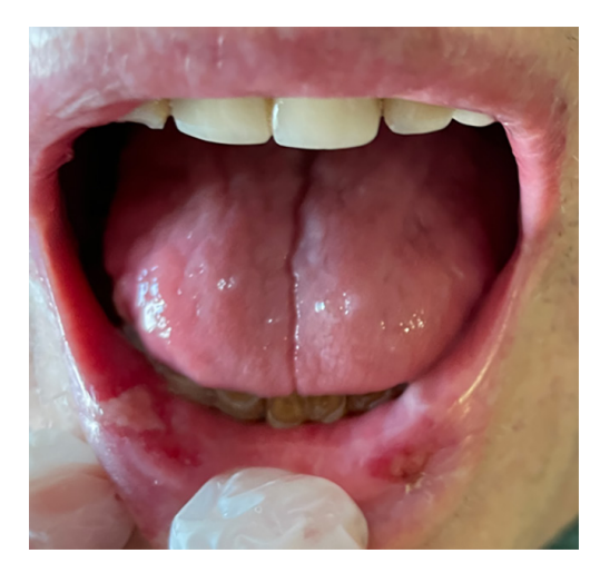
Figure 2 Clinical picture showing the oral lesion on the mucous side of the lower lip 6 days after admission.