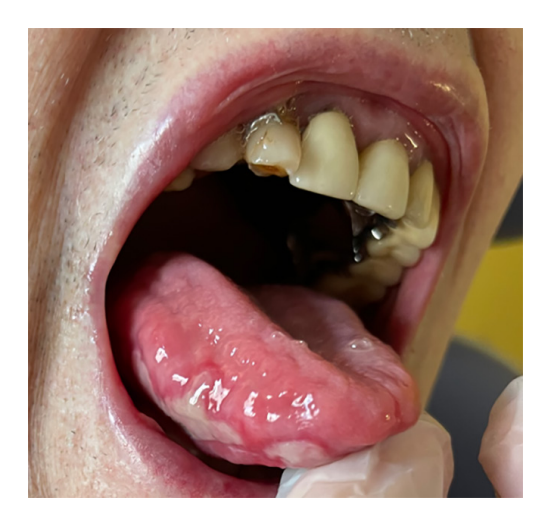
Figure 1 Clinical picture showing the oral lesion on the lateral edges of the tongue 6 days after admission.