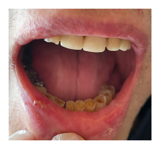
Figure 4 Clinical picture showing the oral lesion on the mucous side of the lower lip after 13 days of treatment.