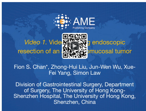
Figure 4 Video showing endoscopic resection of an antral submucosal tumor (6). Available online: http://www.asvide.com/articles/1550