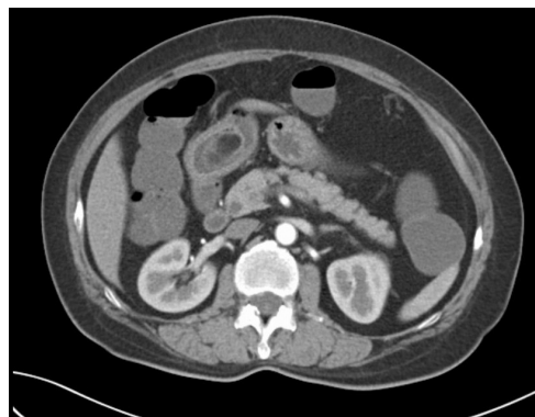
Figure 3 CT scan showed a hypo-enhancing lesion in antrum.

The procedure was performed under general anesthesia with endotracheal intubation. The patient was placed in left lateral position. An upper endoscope (GIF-Q260J; Olympus, Japan) with a water jet function was used and a transparent hood (D-201-11304; Olympus, Japan) was attached at its distal end. The electrosurgical unit used