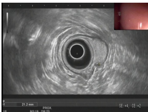
Figure 2 Endoscopic ultrasound showed a hyperechoic lesion located in deep mucosal layer with focal involvement of muscularis propria.

informed of the differential diagnosis, potential need of additional surgery in case of malignant tumor or incomplete resection. The patient opted for upfront resection of without preoperative biopsy of the tumor, as she worried about the suboptimal diagnostic yield of endoscopic biopsy and preferred tumor removal for definitive diagnosis. Endoscopic resection was considered suitable in view of the endoscopic ultrasound findings.