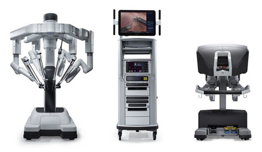
Figure 1 The da Vinci Xi<sup>®</sup> robotic surgical system—a sample view of the robotic operating console, surgical robotic, and surgical monitor. (Intuitive, Incorporated; Sunnyvale, CA).

Patient characteristics have also contributed to differences in ergonomic stress. For example, a patient's increased body mass index (BMI) adds increasing difficulty to a procedure. Additionally, laparoscopy relies on the experience and the knowledge of a surgical assistant and incorrect maneuvering can lead to poor visualization, increased operating room times and intraoperative complications (31). The challenges associated with laparoscopy paved the way for the development of surgical robotic systems, which seek to resolve some of these difficulties.