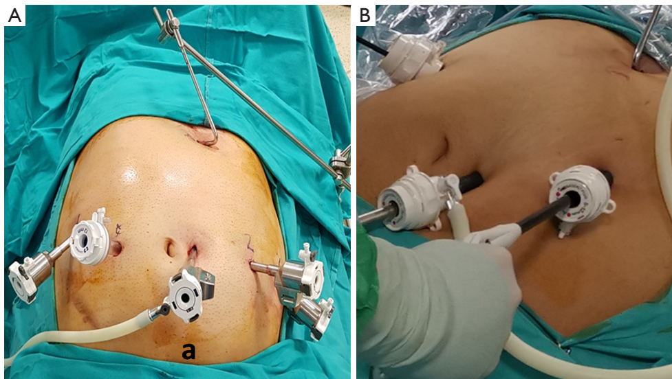
Figure 3 Port placements for SADS for both (A) robotic (daVinci Xi) and (B) laparoscopic approach. SADS, single anastomosis duodenal switch.

resection to create a loose sleeve with the bougie size 42 and over. If you are using 36 F bougie for standard sleeve then staple line should stay 1 cm away from the 36 F bougie. Till this step, procedure is similar to SADI-S.