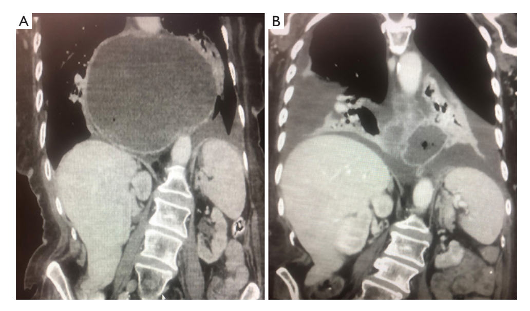
Figure 1 Esophageal perforation. (A) CT scan (coronal view) showing a giant paraesophageal hernia occupying the posterior mediastinum. (B) CT scan (coronal view) of the same patient showing mediastinal and bilateral pleural collections on postoperative day 4 due to delayed iatrogenic esophageal perforation. The patient required an emergency thoracotomy with mediastinal washout and drainage, as well as a laparotomy to place a venting gastrostomy and feeding jejunostomy.

hernia repair is cardiac injury. Cardiac tamponade (11,12) and hydropneumopericardium (13) have been described. A primary cardiological event should be suspected in the first instance, and prompt diagnosis is key in patients developing intra- or postoperative hemodynamic instability (6). Most of the cases reported have happened after a large diaphragmatic defect was repaired by fixing a mesh with staples or tacks. All cases required a reoperation for pericardial drainage and repair. Fatal hemorrhage due to gastro-aortic fistula has been also reported, arising from a gastric ulceration at a suture site, an ischemic fundus, or mesh migration (14).