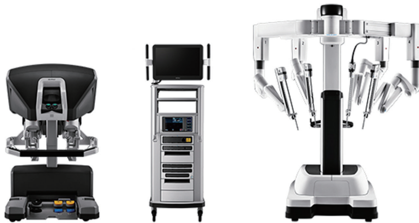
Figure 1 Intuitive Da Vinci Xi Surgical System showing (left to right) surgeon's console, vision tower and patient cart.

more precise movements in scenarios where any erroneous movements could result in disastrous consequences.