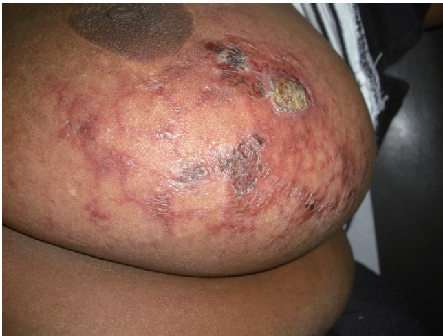
Figure 1 Left breast of a patient with diffuse dermal angiomatosis. Note the red and purple reticular pattern with associated ulcerations