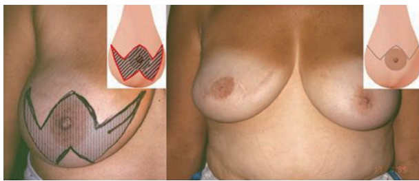
Figure 1 Batwing technique.