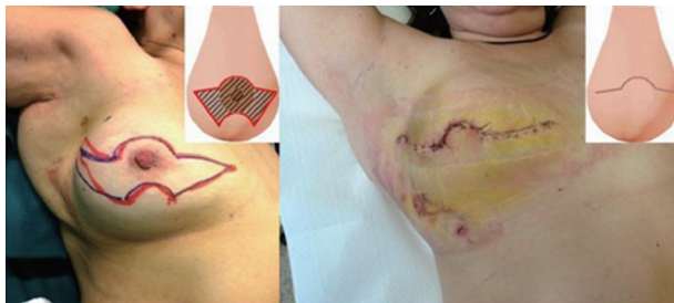
Figure 2 Modified batwing.