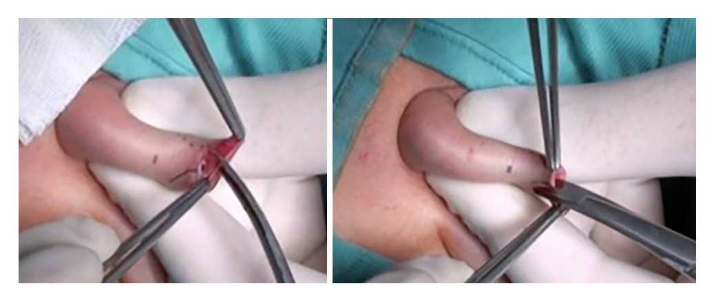
Figure 3 Foreskin is incised on the mucosa along the marked dotted line and on the skin along the marked continuous line and on the mucosa along the marked dotted line.