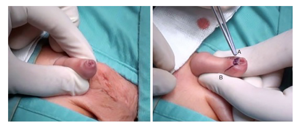
Figure 1 Preoperative; dorsal incisions: (A) inverted V at the apex of the foreskin; (B) regular lower V.