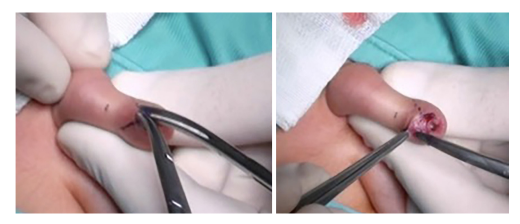
Figure 2 The cup on the tip of foreskin is removed.

One hundred twenty four patients accepted circumcision. Sixty-one underwent preputialplasty (22/balanoposthitis, 18/painful erection, 21/urinary discomfort).