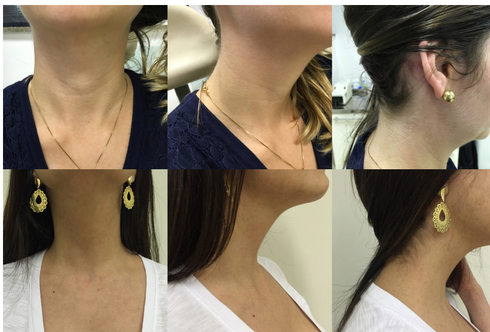
Figure 3 Neck aspect following robotic hemithyroidectomy (two cases after 3 months).