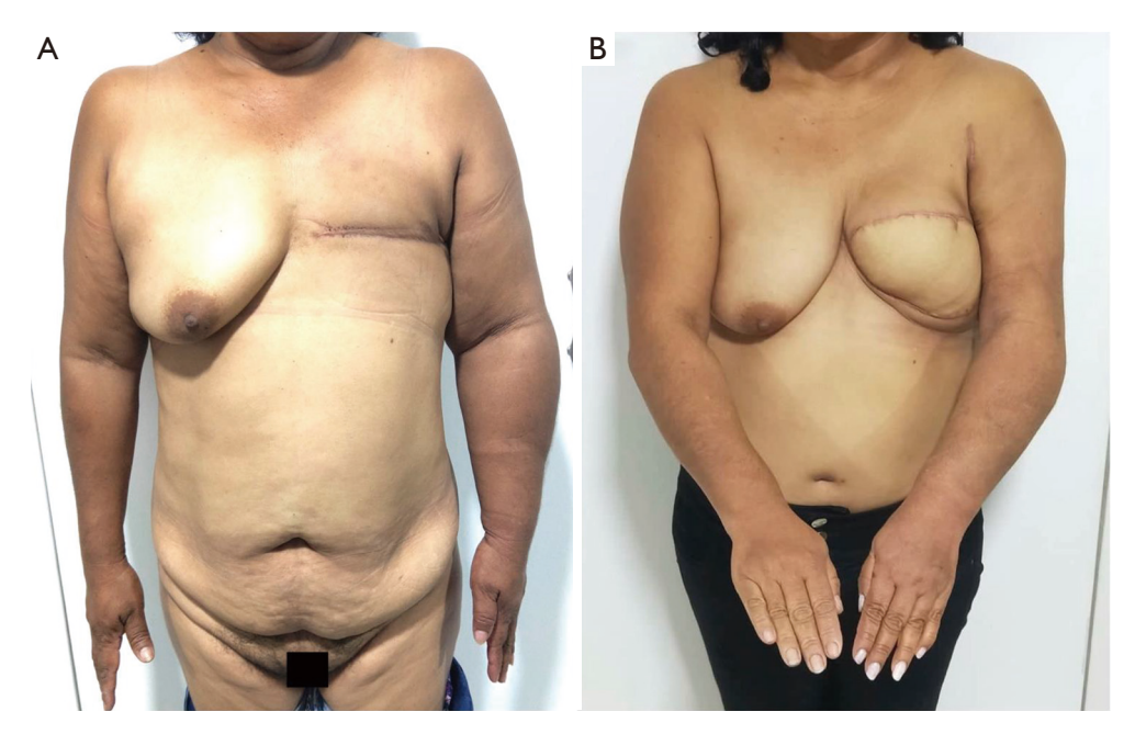
Figure 4 Pre and postoperative pictures of a 45-year-old female patient with right breast cancer-related lymphedema (BCRL). She had received 15 months of complex decongestive therapy with unsatisfactory results. (A) Preoperative picture. (B) Postoperative picture at 12 months of follow-up showing a limb circumference reduction rate of 39%.

The publisher regrets the error and is sorry for the inconvenience caused.