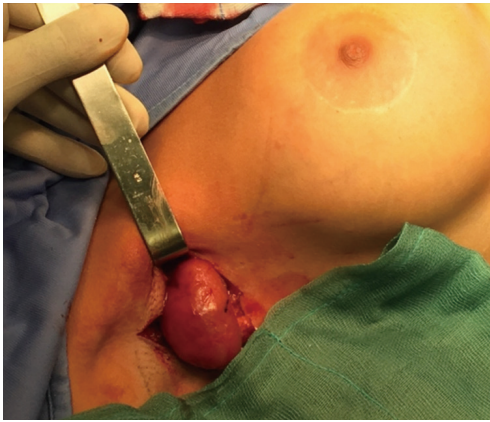
Figure 1 Axillary incision and lymph node exposure.