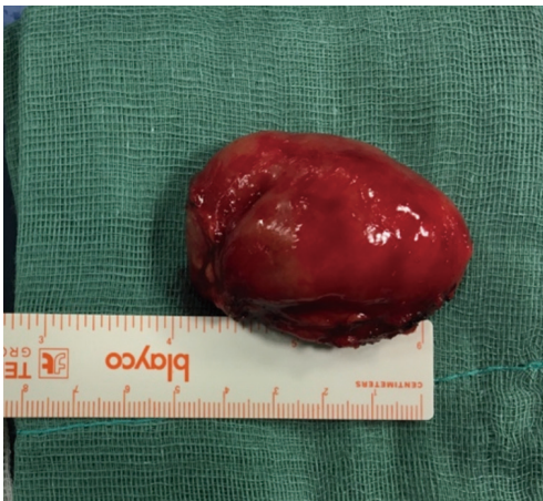
Figure 2 Macrolane lump.