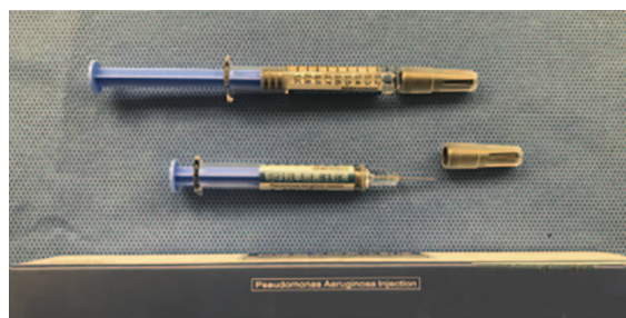
Figure 3 Pseudomonas aeruginosa preparation injection and its outer packaging.

In the non-PAP group, complete hemostasis was performed on the surgical wound, with direct placement of two drainage tubes (a single drainage tube was placed in the sternum and in the axilla, respectively). The incision was made with an interrupted full-thickness suture. After