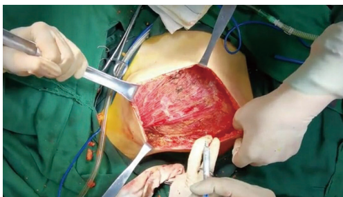
Figure 2 Subcutaneous local spraying of P. aeruginosa preparation.