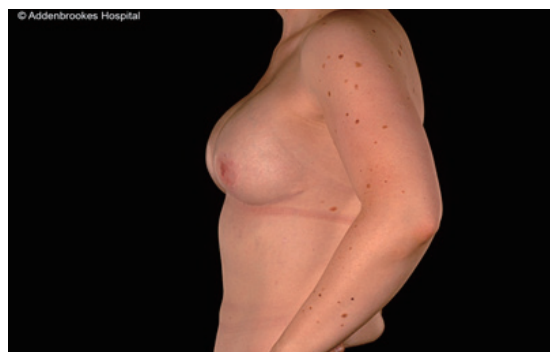
Figure 4 A 42 years old patient 8 months post wise pattern mastectomy and nipple preservation for BRCA 2 mutation carrier (lateral view).

(which facilitates axillary surgery) or possibly a mid-axillary line incision when endoscopic-assistance is employed (34–38). Radial incisions have been popularised by the Milan group but may be less advantageous in the post-Z11 era when fewer patients undergo completion axillary lymph node dissection after a positive sentinel lymph node