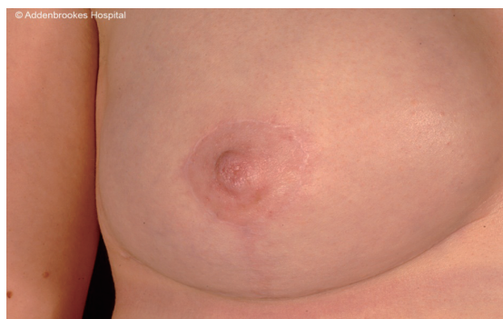
Figure 3 A 42-year-old patient 8 months post wise pattern mastectomy and nipple preservation for BRCA 2 mutation carrier (frontal view).

(which facilitates axillary surgery) or possibly a mid-axillary line incision when endoscopic-assistance is employed (34–38). Radial incisions have been popularised by the Milan group but may be less advantageous in the post-Z11 era when fewer patients undergo completion axillary lymph node dissection after a positive sentinel lymph node