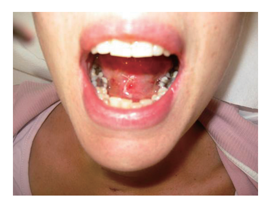
Figure 4 Own patient 4 days after transoral thyroid resection.

Conflicts of Interest: The authors have no conflicts of interest to declare.