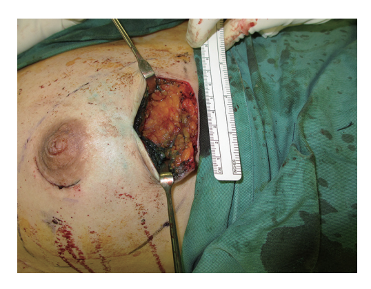
Figure 2 The elliptical resection pattern is demonstrated in this intraoperative photograph.