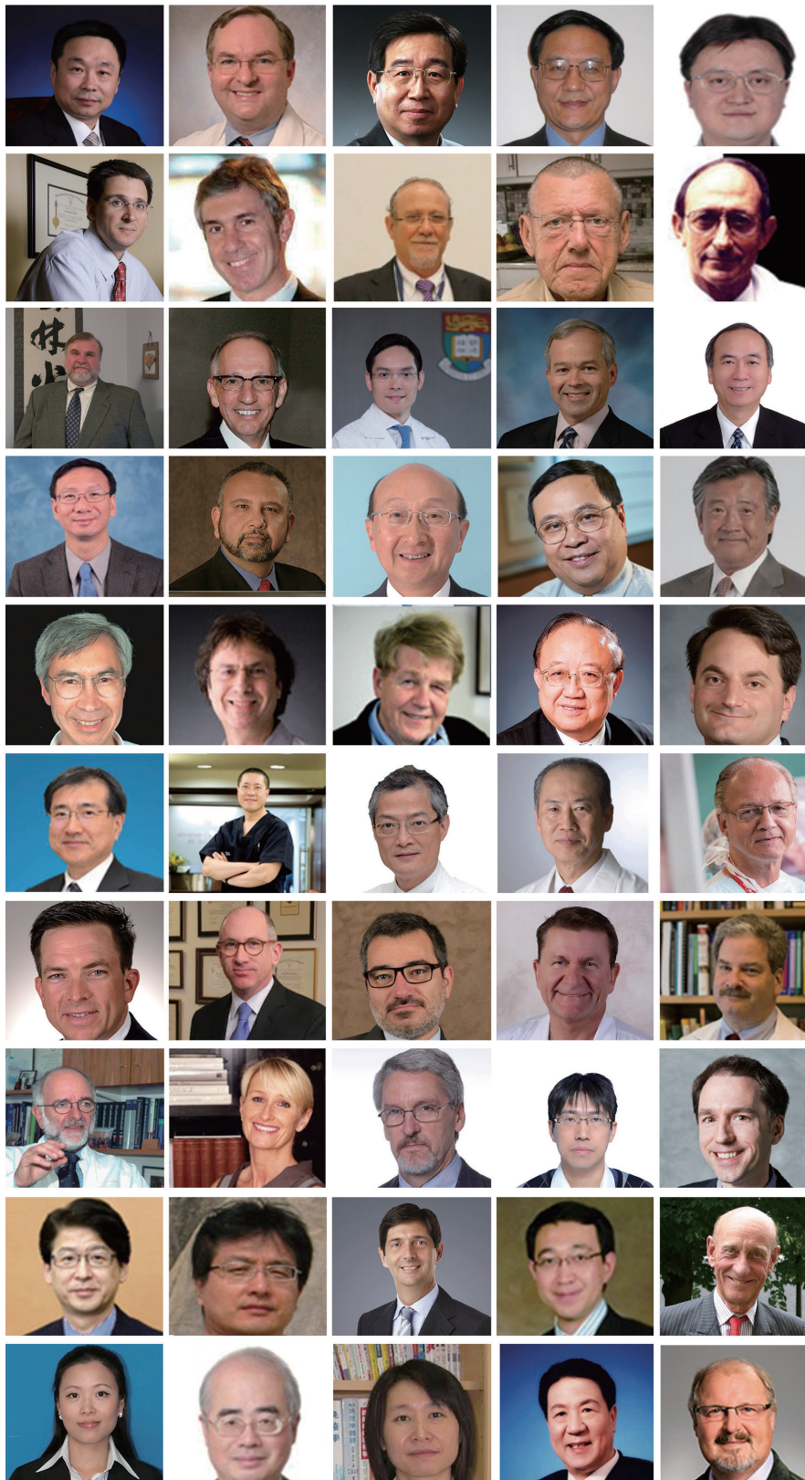
Figure 3 HBSN's Editor-in-Chief, Deputy Editors-in-Chief and Editorial Board Members.