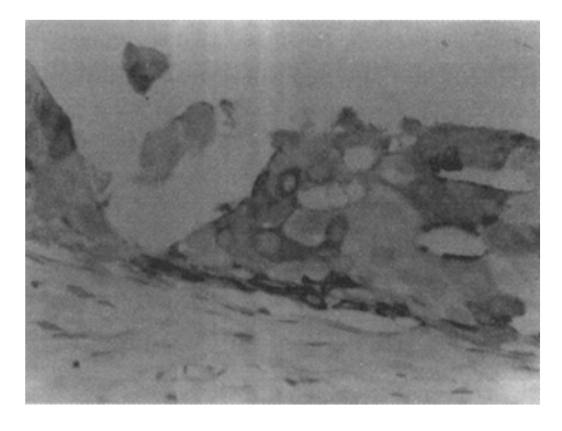
Fig. 2 invasive ductal carcinoma of breast 400 x PS<sub>2</sub> protein positive