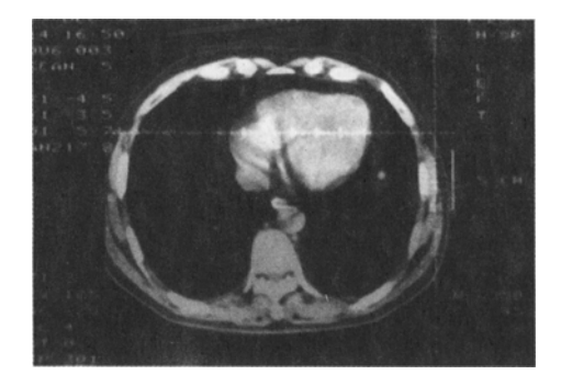
Fig. 1. A retrocardiac nodule 1 cm in diameter was localized by CT graduated grid system.

for histological analysis. Immunochemical and' histo-chemical staining could be performed if required.