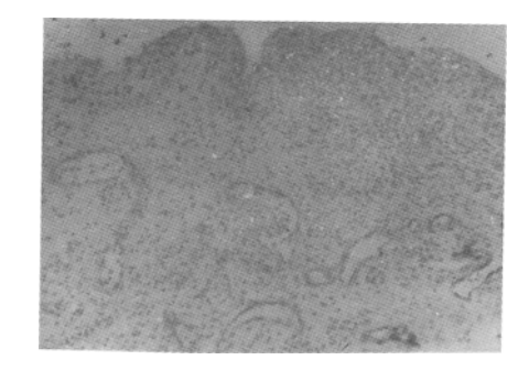
Fig 2. Atypical epithelial metaplasia, showing newly formed blood vessels characterized by uneven distribution, tortuous branching and varied thickness.