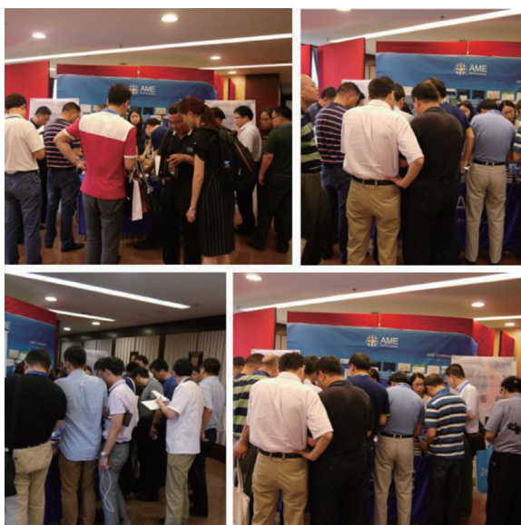
Figure 8 The readers are reading Gastric Cancer attentively.