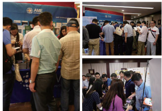
Figure 7 The booth is surrounded by readers.

To make the attendees have a close look at Gastric Cancer , AME Publishing Company also set up a booth outside the launch conference. Let us take a look at the exciting scene at the booth (Figures 7,8).