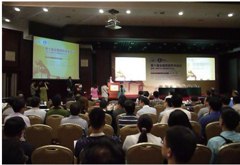
Figure 3 All seats are occupied in the launch conference.