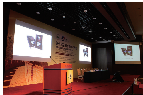
Figure 2 Gastric Cancer is showing on the conference.