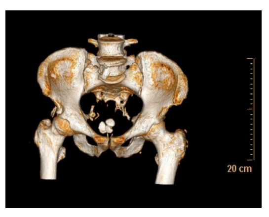
Figure 2 Three-dimensional reconstruction based on plain pelvic CT scan (the cortical bone of the greater trochanter of left femur has been eroded and destroyed, and removal of the local cortical inflammatory tissue and dressing should be considered during surgery).