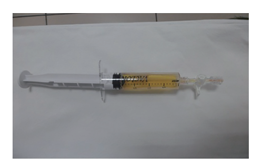
Figure 3 Aspiration fluid.

patient for lymphangioma under endoscopic ultrasound was 2-5 (median: 3), while the number of passes depending on liquid volume and scope. The volume of liquid withdrawn was 50-205 mL. In seven cases, the liquid was colored yellow, whereas one patient had colorless and clear liquid, and in one patient the liquid had a bloody turbidity. Under the microscope, mature lymphocytes were dominant in the aspiration smear. The results of bronchoscopy and aspiration of all nine patients are summarized in Table 1 .