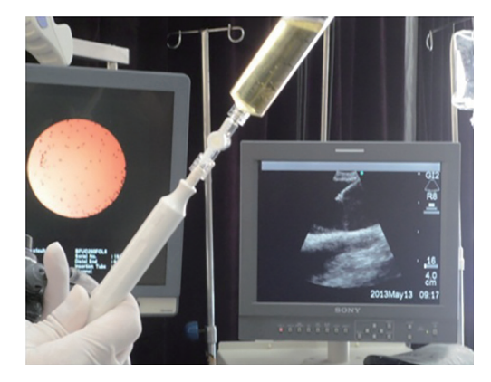
Figure 2 Ultrasound images.