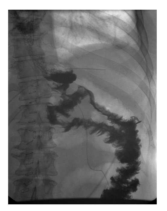
Figure 2 Diagram showing the final anatomy after OAGB. OAGB, one-anastomosis gastric bypass.

Two reviews on the performance of OAGB have demonstrated that, on average, a limb length of 200 cm has been used (5,11). However, in a trial performed by Carbajo et al. on OAGB outcomes in 1,200 patients, the length of the limb was tailored according to the candidates' BMI and comorbidities. For increasing BMIs, an additional 10 to 50 cm—with no specific formula or rationale—of afferent limb was added, maintaining a range of 250 to 300 cm of common channel (16). Similarly, Lee and colleagues adjusted the afferent limb based on the preoperative BMI. In contrast to Carbajo's outcomes, Lee et al. found