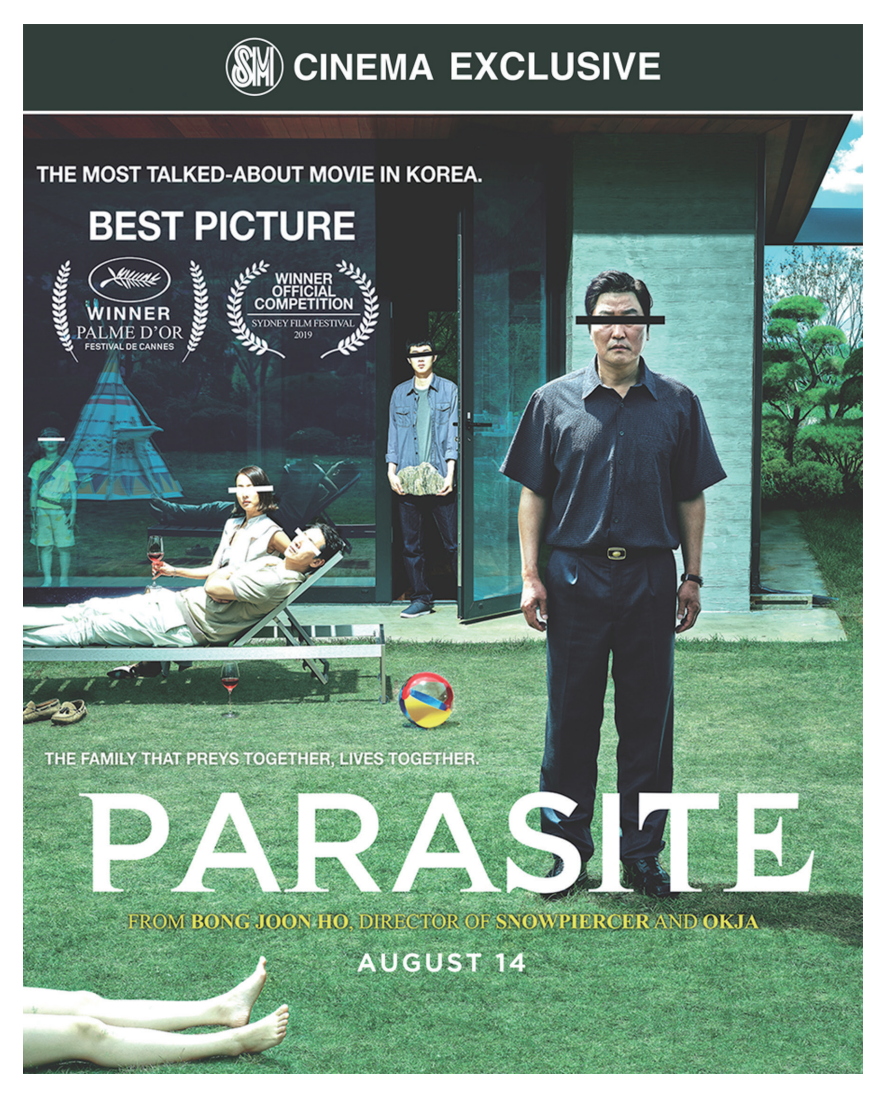
Figure 1 기생충; Gisaengchung (Parasite) 2019, film directed by Bong Joon-ho.

With all likelihood, the coexistence of airflow imitation compatible with COPD and bronchiectasis identified by high- or low-dose computer tomography in the same patient ( Figure 2 ) is not testimonial. A report from Spain found a 57.6% prevalence of bronchiectasis in patients with moderate to severe COPD, and this was associated with greater severe airflow obstruction, isolation of a potentially pathogenic microorganism from sputum, and at least one hospital admission for exacerbations in the previous year (6). Very recently, a systematic review meta-analyzed six observational studies by pooling 881 COPD patients, and reported a mean prevalence of bronchiectasis in patients with COPD of 54.3%, ranging from 25.6% to 69% (7).