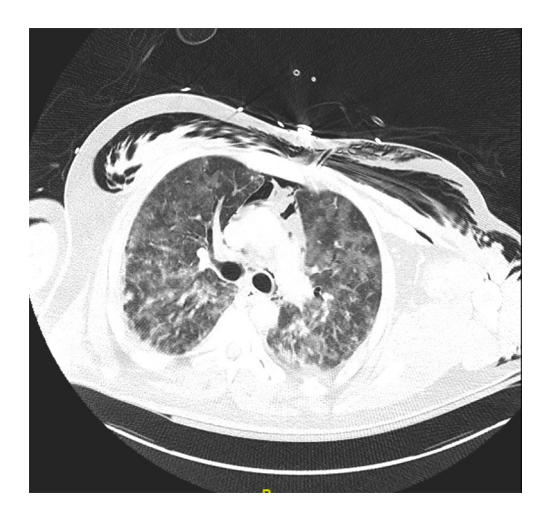
Figure 2 Characteristic CT of the Chest showing extensive bilateral ground-glass opacities, subcutaneous emphysema and mediastinal air, but no pneumothorax.

(4,8). Positive pressure can worsen air deposits or exacerbate small parenchymal leaks. Over time, excessive subcutaneous pressure can theoretically result in decreased chest compliance and increased intra-thoracic pressure causing thoracic compartment syndrome (3). Tension pneumothoraces can also develop without obvious findings on imaging. Classically, this occurs when air is loculated in the anterior or deep sulcus spaces. Fortunately, when these occult processes are significant, they will still manifest changes in hemodynamics or oxygenation. A thorough clinical exam becomes an essential tool in determining the need for intervention. Unfortunately, since a majority of