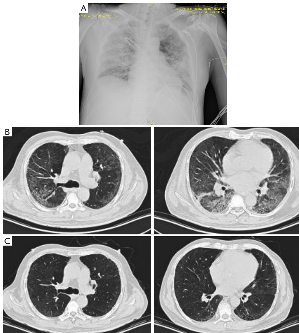
Figure 3 Chest radiography monitoring of a patient with AAV. (A) A chest radiograph taken at the conclusion of ECMO therapy. (B) CT scan of the chest after 19 days in hospital, and (C) after 1 month. AAV, ANCA-associated vasculitis; ANCA, anti-neutrophil cytoplasmic antibodies; ECMO, extracorporeal membrane oxygenation; CT, computed tomography.

vasculitis referred to as AAV. This group of autoimmune diseases involve both small and medium vessels, and includes GPA, MPA, and EGPA (1). When AAV affects other organs, diagnosis and treatment tend to be delayed due to its non-specific clinical manifestations. In a systematic review, the authors enrolled 56 studies on 1,422 AAV patients treated with Rituximab (RTX). Complete or partial remission rates over 80% were reported in most studies. The total relapse rate was 30%. Main adverse events included infections and infusion reactions (35).