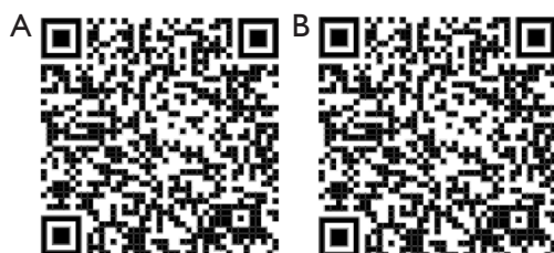
Figure 2 The quick response codes of the two surveys for the laypeople (A) and for the professionals (B).

Table 3 highlights, with the reference to the cardiologists, the assessment on the use of AI in several specific