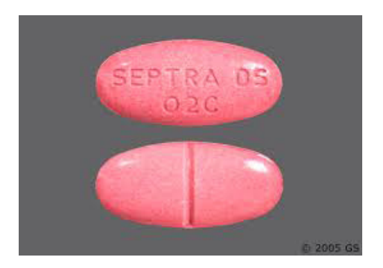
Figure 4 Septra pills.

glued to their computer screens instead of interacting with patients and ward staff, unhappy physicians (a hospital recruiting docs added NO EMR to its ad), the demise of radiology rounds, and the lack of user-centered design that makes many docs yearn for their paper charts.